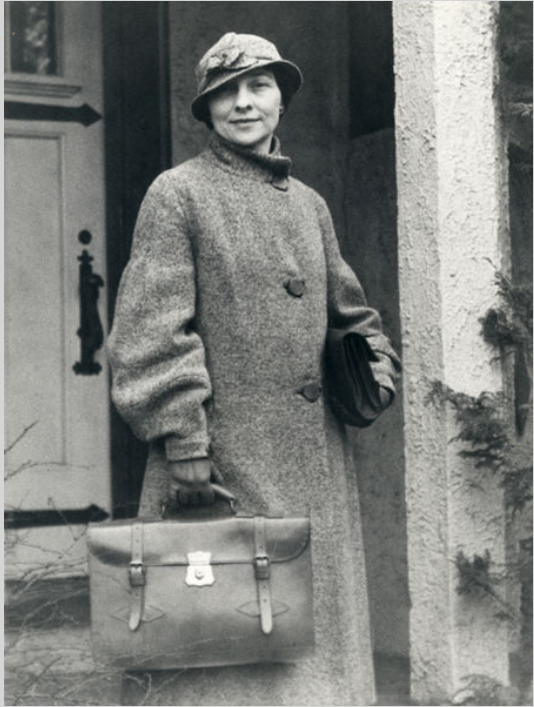
Elisabeth Smith Friedman

Delivered Liberty load today 440 cans alcohol stop require 100 more cans stop have enough solder for 200 cans stop please send solder and cans with first possible vessel